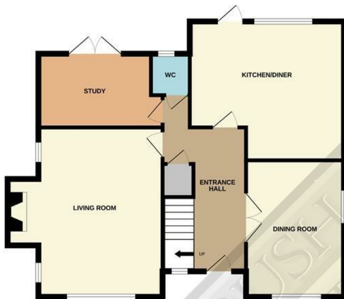
GROUND FLOOR 808 sq.ft. (75.1 sq.m.) approx.